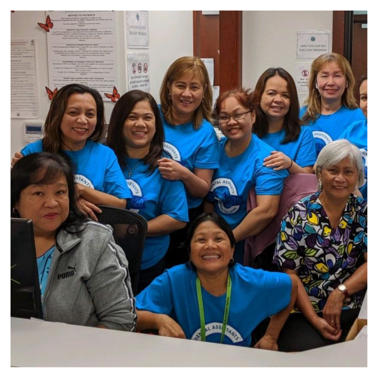
Our Dental Assistants are the Best!

Every year, dental assistants get a special week dedicated to them for all the great work they do! Dental Assistant Recognition Week has been designated by the American Dental Assistants Association, as the time to acknowledge dental assistants' key role in providing patients with quality dental care. During March 1-7, KKV's dental providers and staff showed their deep appreciation for our wonderful hard-working dental assistant team by pampering them with continental breakfast and other goodies to enjoy. Mahalo to our fun and caring dental assistants for all that they do every day!