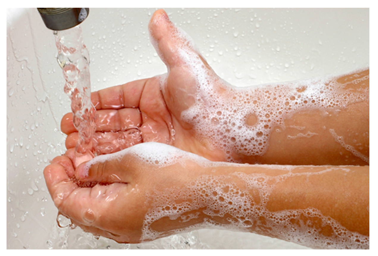
Preparing to Protect Our Community