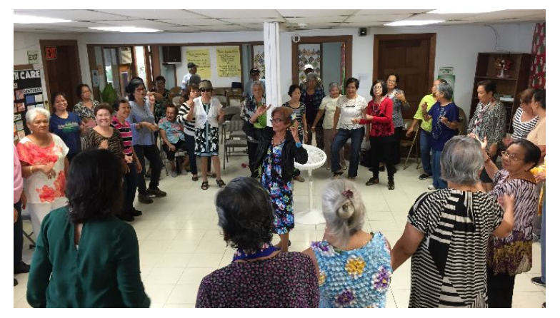
On October 15, Hawaii Business Magazine published an article "Helping Seniors Stay Healthy" about KKV's Elder Care program: <a href="https://www.hawaiibusiness.com/helping-seniors-stay-healthy/">https://www.hawaiibusiness.com/helping-seniors-stay-healthy/</a>