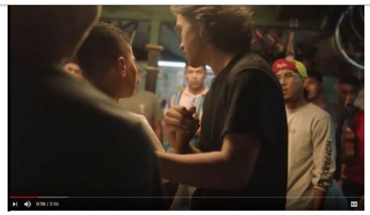
"Mobilizing young men in the Kalihi Valley community through biking" <a href="https://youtu.be/AVLz54VYiy0">https://youtu.be/AVLz54VYiy0</a> The video is a production of the Movember Foundation, which is partnering with Prevention Institute and KKV's Kalihi Valley Instructional Bike Exchange (KVIBE) in the Making Connections initiative to improve mental health and wellbeing for men and boys. The project is working collaboratively with the Kalihi community to build self-confidence, social connections, and cultural pride which are critical for achieving health and wellbeing. KVIBE engages boys and young men in activities that provide safe spaces for them to be physically active, develop their bike mechanics skills, and grow as community leaders. A healthy man and boy means a healthy community—a connected community!