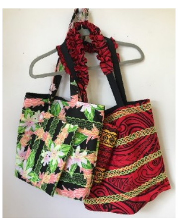
Seams Wonderful Holiday Sale Friday December 20 - 10:00 - 4:30 Roots Cafe'

Put it on your calendar! Shop for beautiful bags, shirts and dresses created by Seams Wonderful seamstresses.